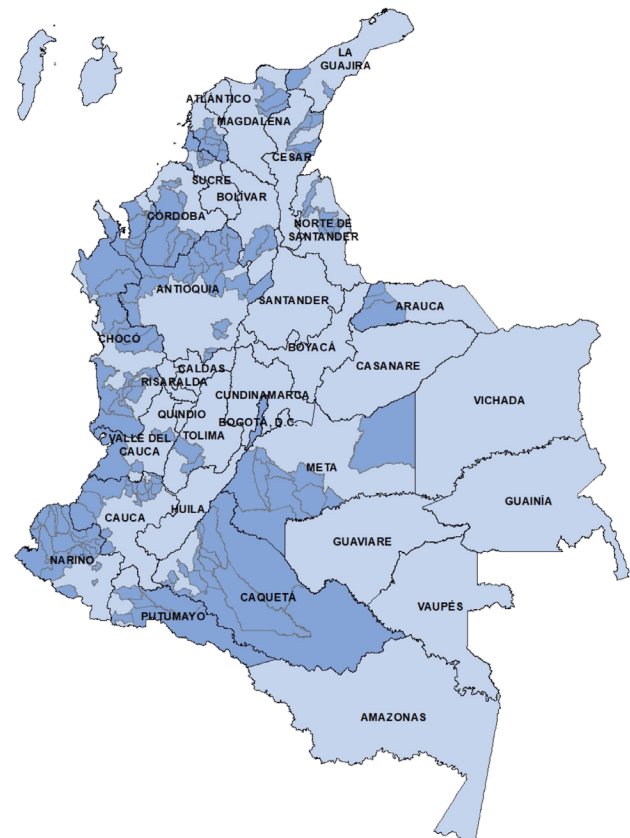
Figure 2: Territorial distribution of the 152 formalized Local Justice Systems

133 are located in municipalities prioritized by the Development Programs with a Territorial Approach (PDET)<sup>80</sup>