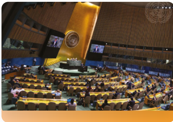
The UN General Assembly adopted a resolution establishing an independent institution on the missing in Syria (New York, USA, June 2023. Photo Credit: UN Photo/Manuel Elias)

Pathfinders program launches “Rising to the Challenge” report at High-level Political Forum.