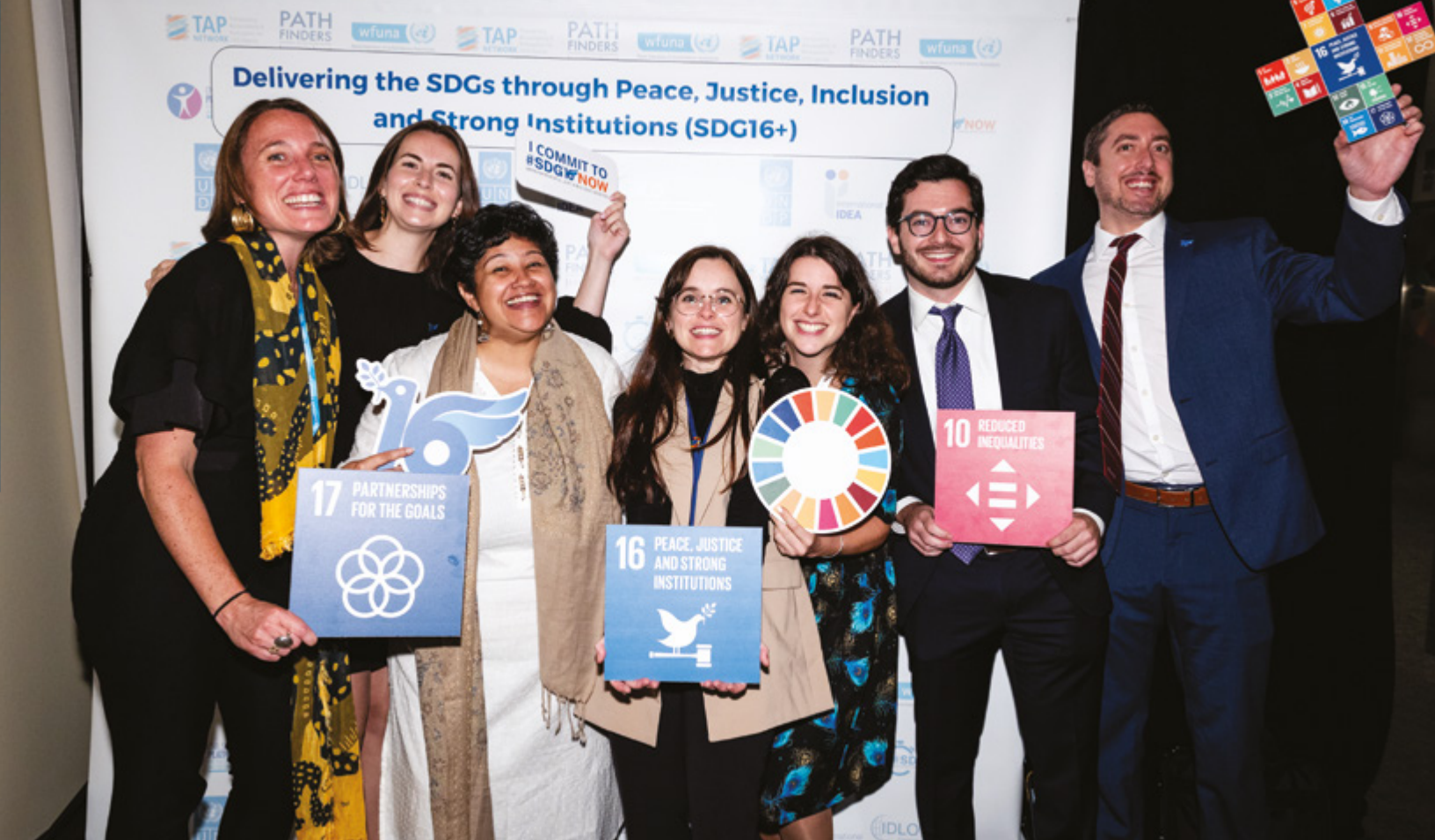
Pathfinders team photo at the SDG16+ Coalition event on the sidelines of the UN General Assembly (New York, USA, September 2023).