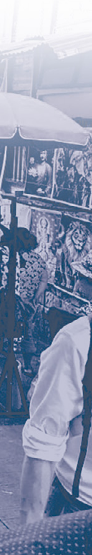
Cover photo: Participants in the Peace in Our Cities convening exploring successful urban violence reduction initiatives (Palmira, Colombia, June 2023)