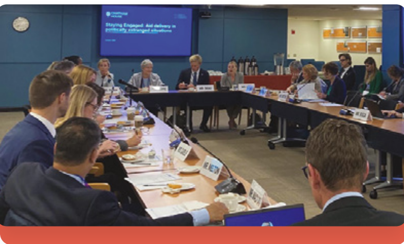
CIC and Chatham House co-hosted a high-level roundtable with the World Bank Executive Director's Office of the Nordic and Baltic Countries on aid delivery in estranged situations on the sidelines of the Annual Fall Meetings of the World Bank and IMF (Washington D.C., USA, October 2022)

In the past year, CIC regularly published expert insights to foster cooperation among national governments, international organizations, and the broader policy community. One year after Russia's invasion of Ukraine, we examined the geopolitical struggle and discussed its multifaceted consequences. Our analysis extended to navigating opportunities and challenges in the evolving global landscape, including insights from the IMF-World Bank Spring Meetings. Additionally, we explored effective donor engagement strategies worldwide. The UN General Assembly was also a key focus, emphasizing the importance of compromise in development financing. More recently, we provided insights into the Israel-Hamas conflict, shedding light on the intricate dynamics of this tragic situation.