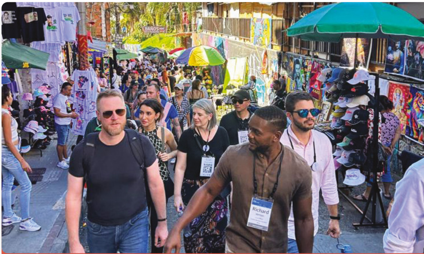
Participants in the Peace in Our Cities convening exploring successful urban violence reduction initiatives (Palmira, Colombia, June 2023)

In May 2023, the Gender Equality Network for Small Arms Control (GENSAC) relaunched, gaining recognition in key international arms control forums. GENSAC representatives took part in the final session of the UN Open-Ended Working Group on Ammunition, advocating for a gender-inclusive arms control approach and the inclusion of women in these processes. GENSAC also ensured representation from women in civil society at arms control discussions at the Conference of States Parties to the Arms Trade Treaty, the SGD16+ Rome Conference, and ECOWAS, and convened Latin American elected leaders to address legislation aimed at combating femicide by restricting gun ownership for convicted domestic violence offenders.