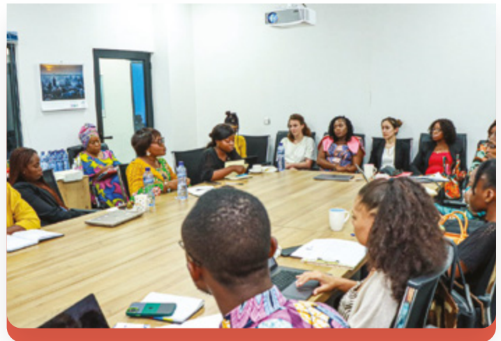
CRG and Ebuteli hosted a discussion on "Gender Equality in the DRC: Priorities for 2023" to highlight women's participation in politics (Kinshasa, DRC, February 2023)