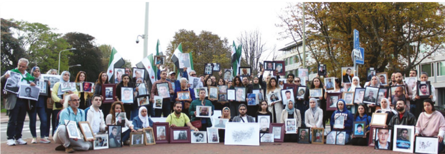
Families, survivors, and activists came together to advocate for the rights of victims, aiming to end enforced disappearances in Syria (The Hague, Netherlands, November 2023.)

Finally, through its MENA program, CIC and partners helped raise concerns about the inadequate international response to the February 2023 earthquake in Turkey and Syria, prompting a call to the UN secretary-general to initiate an inquiry, subsequently leading to an internal review.