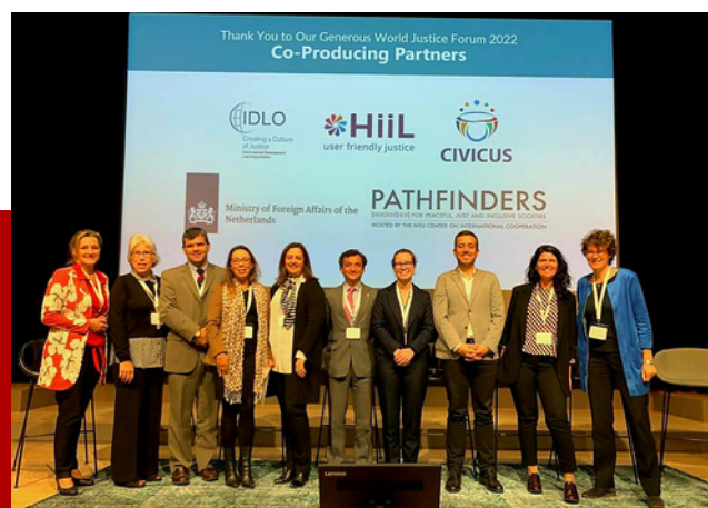
Launch of the Ibero-American Alliance at the 2022 World Justice Forum.