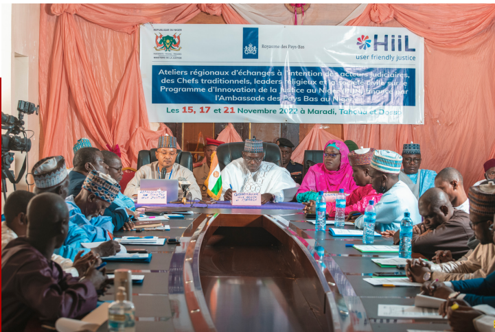
Regional workshops on people-centered justice in Niger.

This program supported all of a country's activities, with an annual call for innovations to address frequently occurring justice problems, an Innovation Award, and access to the Accelerator Program to support scale up. In 2022, the Innovating Justice Fund was launched, which is starting to make its first investments.