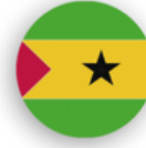
SÃO TOMÉ AND PRÍNCIPE