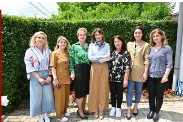
Minister of Justice visits the safehouse of domestic violence victims in Mitrovica

In addition, the Strategy was consulted online through the Government public consultation platform (May-June 2023), allowing each citizen to provide his or her views on this Government policy.