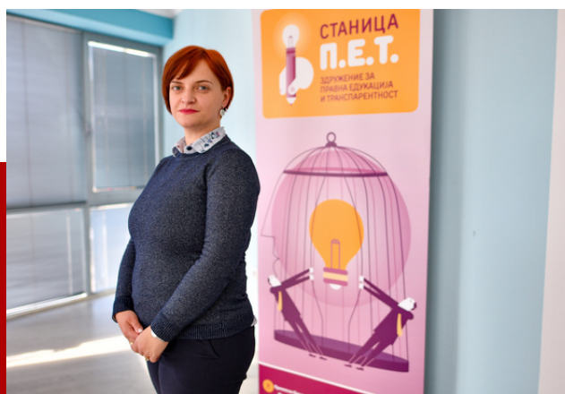
The Association for Legal Education and Transparency (L.E.T. Station) is an example of a local people-centered justice organization working to improve access to justice for marginalized groups in North Macedonia.