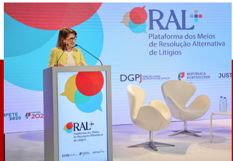
RAL+ Platform launch.

The RAL+ Platform will launch a digital Peace Court, which will expand access to ADR virtually.