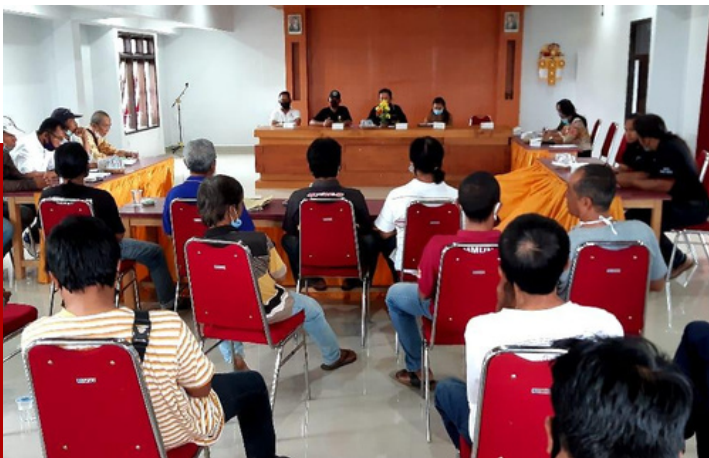
Mediation by paralegals in Village Legal Service Post, Bali.

A legal aid information and database system was launched in 2016 to ensure professional, accountable and transparent implementation of legal aid. The web-based app is equipped with tools to monitor the quality of legal aid delivery, verification/accreditation for legal aid providers and reimbursement systems. In addition, several other apps have been developed to advance access to justice, with a particular eye towards increasing public information and enhancing accountability.