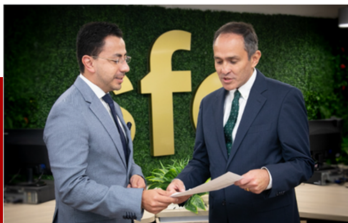
The Conciliation Center of the Financial Superintendency of Colombia increases consumers' access to justice.

This center, launched in Bogotá in 2022, seeks to protect the rights of financial users in-person or virtually. The center was created to help financial users avail an easy and free tool to secure their rights by facilitating dialogue with banking entities, thereby promoting a more symmetrical relationship between individuals and the banking sector. It is expected to serve more than 5,000 people.