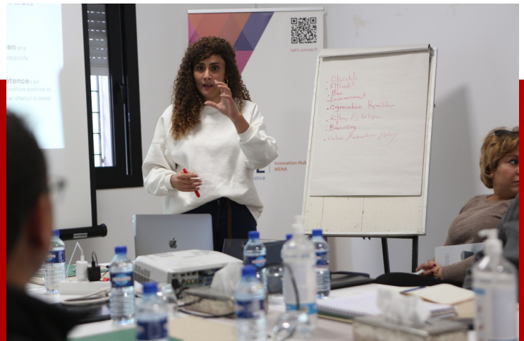
An incubation program in the Innovation Hub MENA in Tunisia.