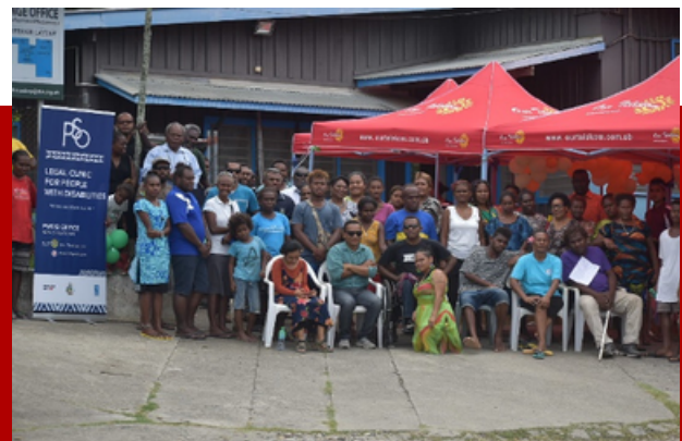
Awareness-raising event promoting access to justice for people with disabilities