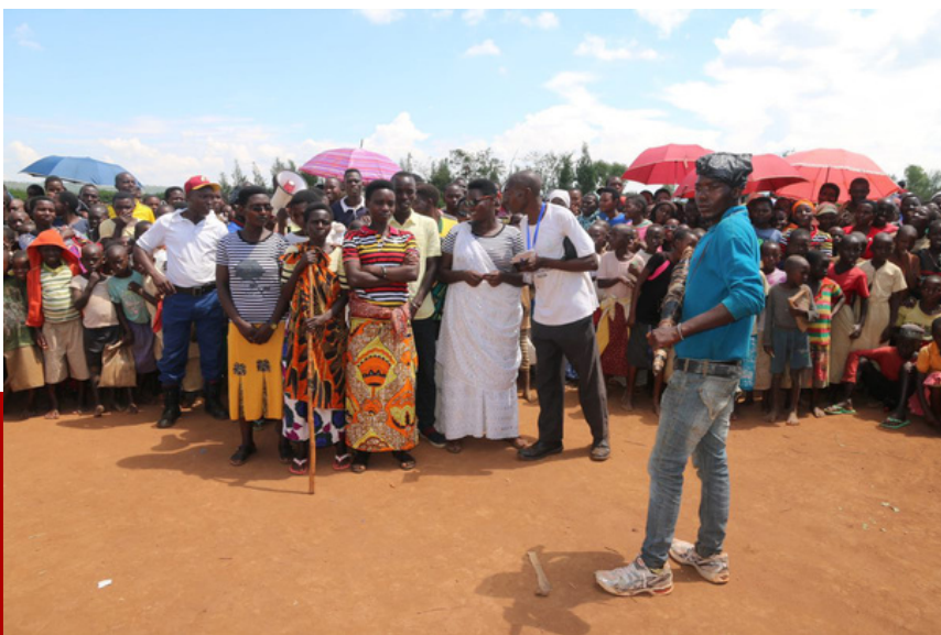
Building Bridges Burundi, 2022 World Justice Challenge finalist in the Access to Justice category

In 2019, with the Global Insights on Access to Justice , the WJP conducted one of the most extensive global legal needs surveys to provide insights into how people around the world, shedding a light on the prevalence and ubiquity of justice problems, people's experience throughout their justice journeys, and the degree to which justice needs go unmet. This allowed the WJP to contribute technical expertise on the inclusion of access to civil justice in the SDG indicators. This research is complemented by the Atlas of Legal Needs Surveys , a systematic mapping of all other publicly available legal needs surveys.