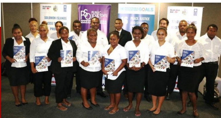
Awareness-raising event promoting gender equality and social inclusiveness.

The UNDP Solomon Islands Access to Justice baseline study found that those with a disability were less satisfied with national level justice services and with ways of resolving disputes. The study also found those with a disability were twice as likely to think that national-level justice services had worsened. People with disabilities in Solomon Islands now benefit from a revamped legal clinic, operated by the People with Disabilities Solomon Islands (PWDSI) in partnership with the PSO, which facilitates free legal advice and representation.