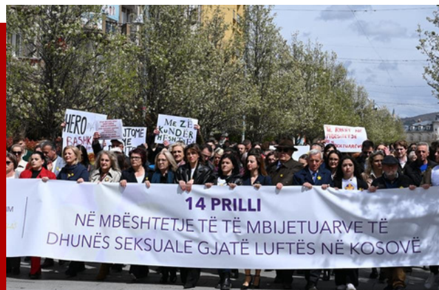
Solidarity march for survivors of sexual violence during the war.