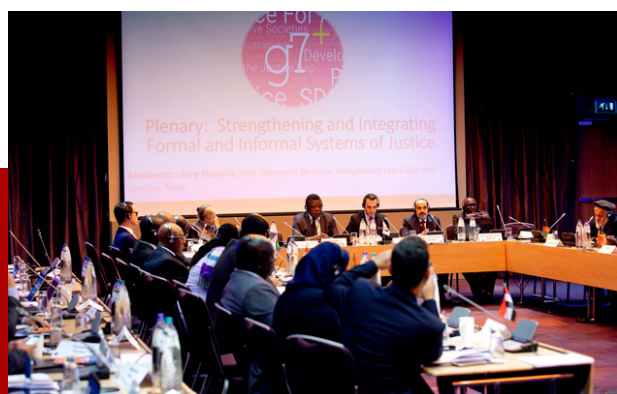
g7+ Ministers of Justice held the plenary discussion on Strengthening and Integrating Formal and Informal System of Justice during the Justice Ministerial Meeting in the Hague, Netherlands in 2019.

For the g7+, access to justice is crucial to fighting inequalities, regaining people's trust and indispensable for conflict prevention in fragile and conflict-affected countries. It is equally important for international development partners to ensure that assistance they provide to justice systems is sensitive and appropriate for national contexts they support.