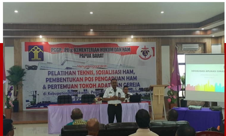
Priests, Tribal Chiefs and Community leaders trained as paralegal in Manokwari West Papua.