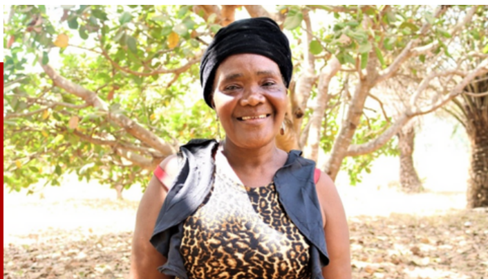
UNDP mainstreams human rights and women's voices into multi-stakeholder platforms, including in Sierra Leone .

UNDP uses a context-tailored, human rights-based approach to support the development of legal frameworks, strengthening of national rule of law rights institutions, establishment of legal aid mechanisms, and empowerment of those most at risk by providing legal information and advice. This contributes to access to justice for millions of people annually, serving 78 million people in 2021 and 85 million in 2022. UNDP uses a variety of strategies to support programming, contribute to global knowledge and develop policy including: the Justice Futures CoLab for strategic, people-centered and integrated approaches based on evidence and learning; investment in M&E; Accelerator Labs to test innovations; the Environmental Justice Initiative; and the Gender Justice Platform.