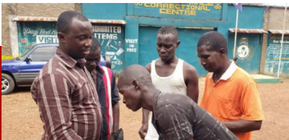
Inmates released during Judicial Week shake hands with the Judiciary Spokesperson.