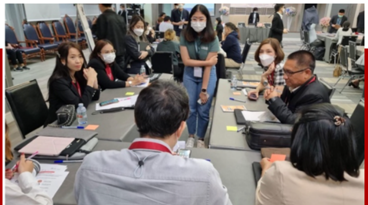
Justice by Design : Transforming Thailand's judicial system through collaboration, empathy, and innovation.

The Court of Justice in Thailand collaborated with UNDP, the Thailand Institute of Justice (TIJ), and the LUKKID Group to co-design solutions to make justice more accessible, efficient, and user-friendly through a collaborative process of empathy, ideation, prototyping, and testing. This groundbreaking initiative addresses the challenges Thai judicial system and court users face, with a focus on inclusive justice services for marginalized groups.