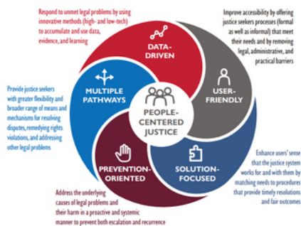
Exhibit 2: People-Centered Justice Elements

The Policy endorses the Hague Declaration and references the United Nations Sustainable Development Goals, particularly Goal 16. It prioritizes the use of data to develop user-friendly and problem-solving justice systems and services and calls for greater investments to develop innovation platforms to close the justice gap. USAID also has launched a new Rule of Law Innovation, Design Experimentation, Acceleration, and Solutions (IDEAS) Lab. The Lab is currently focused on a range of projects supporting USAID's "First Wave" of people-centered justice activities, including, for example by compiling learning from our partners' efforts to develop methods for measuring social, cultural, and behavior change in Colombia, facilitating a justice innovation network in Kosovo, implementing procedural justice initiatives in the courts of Georgia, conducting local justice needs surveys in Kyrgyzstan, convening court-community dialogues in Serbia, and introducing an online community justice house in Ukraine.