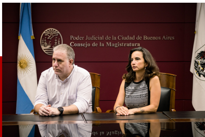
Buenos Aires' Council of Magistrates and the Civil Association for Equality and Justice launched JusLab to promote transparency and accountability in the judicial system.

Indonesia, a member of OGP since 2011, is currently implementing its seventh National Action Plan. The OGP Support Unit has closely assisted Indonesia's justice commitments, which focus on expanding and improving legal aid, especially for vulnerable groups. Through the formal OGP co-creation process, Indonesian justice service and civil society organizations have an ongoing dialogue mechanism with government counterparts to design and implement justice reforms.