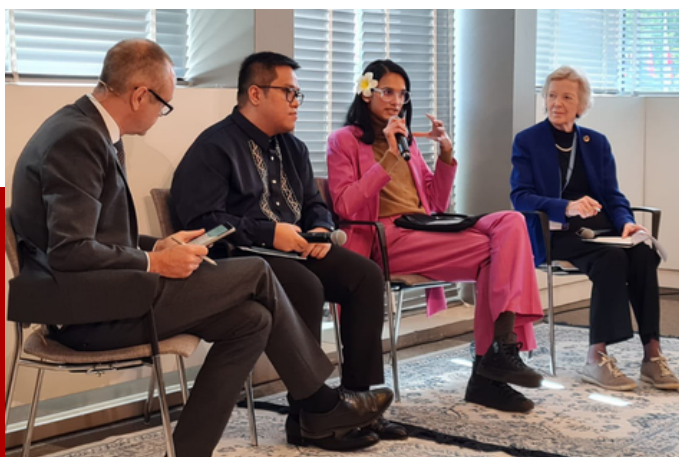
Members of the Young Justice Coalition in dialogue with members of the Elders.

At the international level, Pathfinders supports multilateral discussions on people-centered justice at the U.N. through regular meetings and convening. Following the recommendation of the Justice for All report, Pathfinders conceptualized the Justice Action Coalition and brought it to fruition with the support of the Netherlands Ministry of Foreign Affairs. The program currently serves as the secretariat to the Coalition comprising 19 countries and 15 partner organizations. It also convenes bilateral donors regularly to discuss investments in scalable and people-centered justice; the Ibero-American Alliance for Access to Justice ; and the Young Justice Leaders , bringing young voices to the fore and advancing their perspectives with policy and decision-makers at the highest levels.