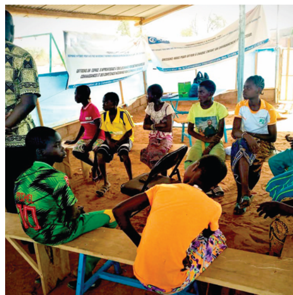
A Community House of Justice in Burkina Faso.

Together with many partner organizations and countries, four task forces that are part of the Working Group on Justice for Children on SDG16+ of the Justice Action Coalition, are developing briefs on four strategic levers to advance justice for children: the first, which was jointly endorsed by the UNODC and Office of the Special Representative of the Secretary-General on Violence Against Children, was launched at a High Level Side Event at UNODC Crime Commission in 2023 with support from the governments of Brazil, Canada, Netherlands, Thailand, and Indonesia.