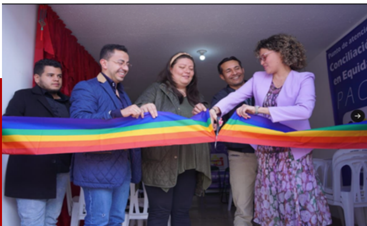
Members of the Diferencia Foundation open the first LGBTI PACE-Floralia in Kennedy, Bogotá.