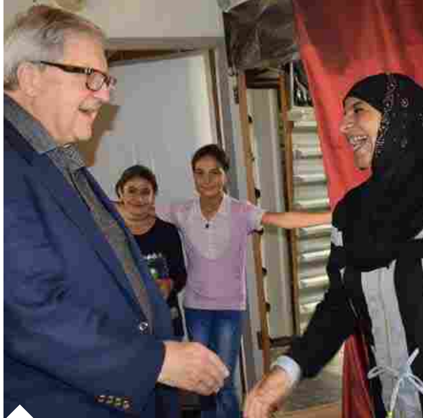
WRC Chair Lloyd Axworthy meets with refugees at the Zaatari refugee camp in Jordan.

The outcome of our work is contained in this report; it is based on a general consensus of WRC members at our meeting in Greece at the beginning of the summer. It is a compendium of