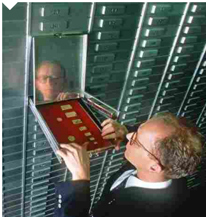
Once known as a safe haven for investments by corrupt leaders, Switzerland now has one of the most effective programs for freezing and repurposing assets.

In order to assess progress on responsibility sharing for refugees, indicators should be developed to measure the extent to which governments are acquitting their responsibility. These indicators should reflect the full range of measures, from hosting refugees to providing technical advice to contributing funds to confronting xenophobic narratives. In particular, the WRC notes that good work is presently being carried out by DARA to develop a refugee policy index. 4 An independent monitoring group is best placed to keep track of governments' compliance and to issue regular public reports.