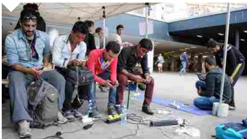
Refugees stay connected with free internet access in Budapest, Hungary.

Language barriers are a universal challenge in communicating with refugees. Translation and language learning apps have been helpful in enabling refugees to access medical care and education. For example, NaTakallam offers translation from English or French to other languages including Arabic, Kurdish, Spanish and Farsi, and also provides translation and transcription services delivered by refugees from Syria, Iraq, Afghanistan, Pakistan, Iran and the Democratic Republic of Congo. It also facilitates language instruction via Skype from Arabic-speaking displaced persons, offering them a source of income. 2 Tarjimly is an app that provides free, real-time translation services to both refugees and aid workers; 3 for more nuanced interactions, refugees can sometimes