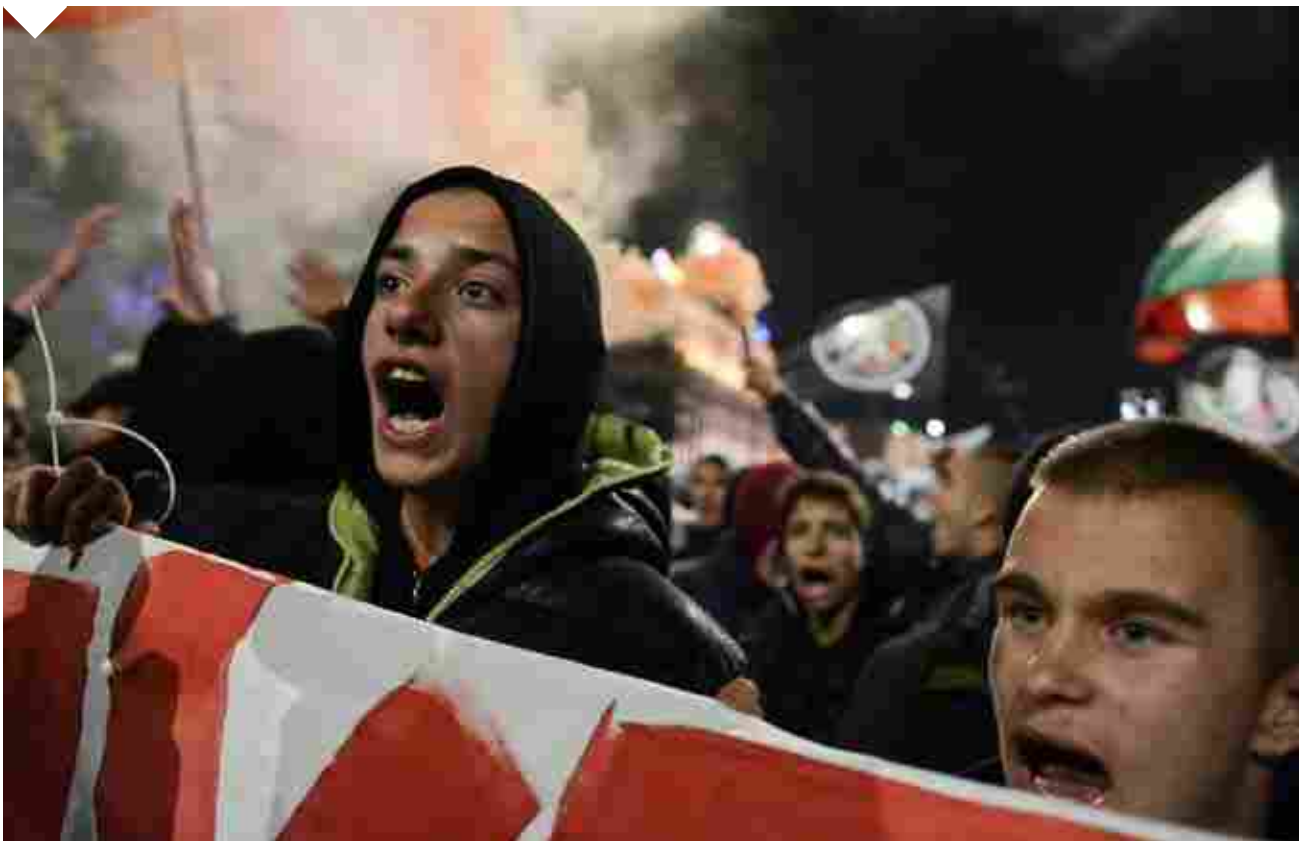
Anti-migrant demonstration in the Bulgarian capital, Sofia.

The WRC recommends that a network of global women leaders, in support of the WRC's recommendations, be convened as part of the Global Action Network for the Forcibly Displaced.