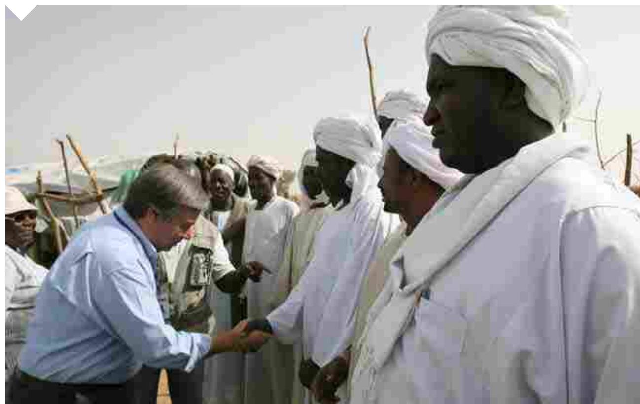
UN Secretary-General and former UN High Commissioner for Refugees António Guterres meets with Chadian community representatives in Darfur in 2007.

There is a strong imperative for authentic organizations to give refugees