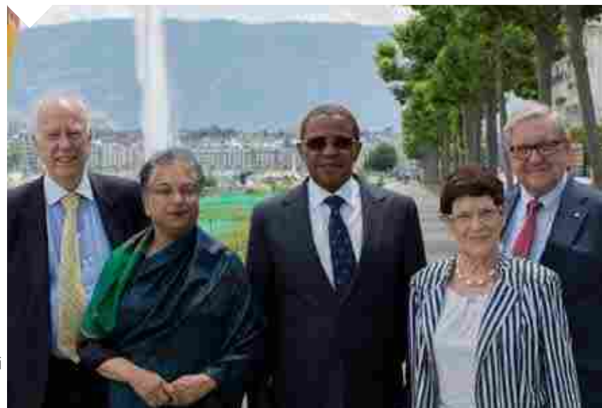
WRC executives (left to right): Deputy Chair Paul Heinbecker; Co-chairs Hina Jilani, Jakaya Kikwete and Rita Süßmuth; Chair Lloyd Axworthy.

The Global Action Network will promote diplomacy and political collaboration, sharing resources and communicating proactively, in efforts enriched by goodwill and focused on new policy initiatives and action. We invite you to join us in that cause.