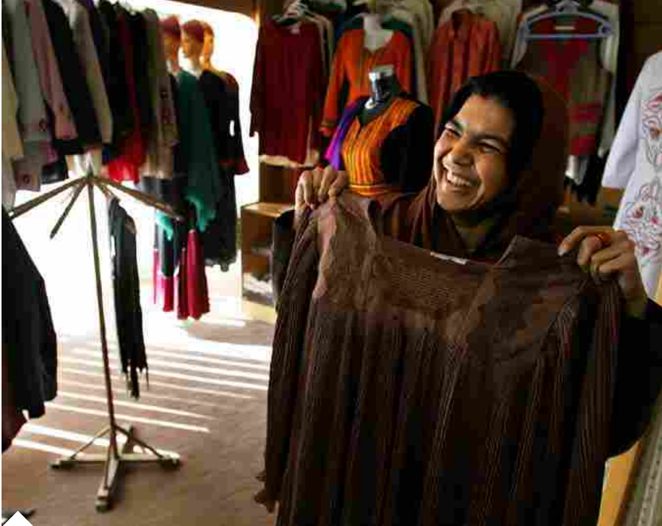
A former Afghan refugee makes and sells dresses at her clothing shop in Kabul. The dresses are made from burqas once mandatory under the Taliban regime.