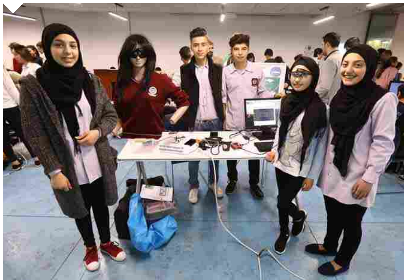
Syrian and Lebanese students collaborate on solutions using low-cost and accessible technology through programs in host community schools.

Source: IDRC. For more information, see www.idrc.ca/en/project/digital-learning-innovations-syrian-refugees-and-host-communities and coder-maker.org .