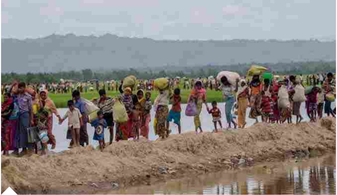
Forced from their villages in Myanmar, Rohingya Muslims cross into Bangladesh in late 2017.