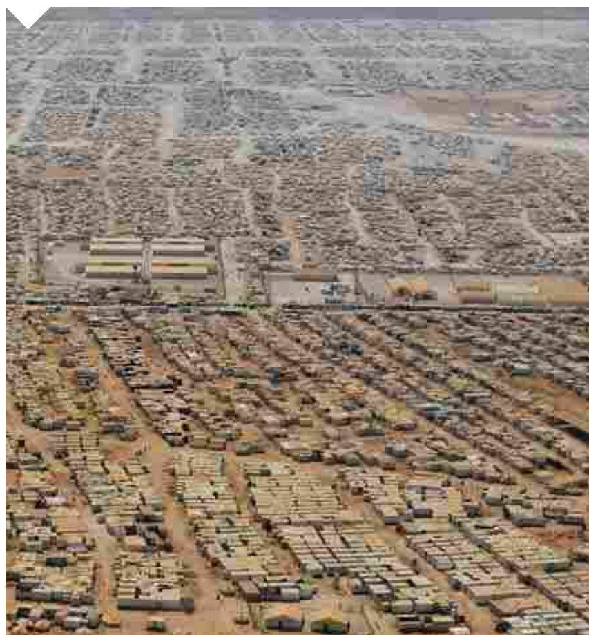
Sprawling camps in places such as Khartoum, Sudan, have housed millions of displaced people, some for decades.

Third, more than half of the world's refugees and IDPs are women or girls, and half of all refugees are children under the age of 18 (UNHCR 2018b). Women and girls face particular risks of violence before, during and after their movement. Women and girls are also all too often viewed solely as victims, left out of decision-making processes and leadership opportunities, despite the crucial role they play in keeping their communities and families together through crises. Women and girls have specific health needs, in particular for reproductive and maternal health care. Despite the unique vulnerabilities, as well as capacities, of refugee women and girls, responses are all too often gender-blind or even gender-harmful. Currently, we lack sufficient gender- and age-disaggregated data that could be used to assess how funding is being distributed and to better understand the specific impacts and vulnerabilities experienced by different sectors of the population. Children and youth, whether travelling alone or with their families, are at risk during their journeys, at borders and during their displacement (Bhabha and Dottridge 2017). Youth are a key demographic