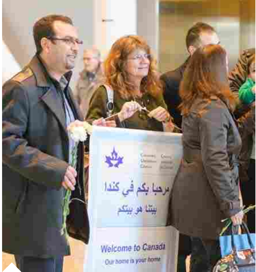
Canadians have welcomed some 275,000 refugees since 1979 through a program that has become a model for other countries.

While some have argued that responsibility sharing has achieved the status of customary international law, “the more widely-held view is that while the principle of responsibility- or burden-sharing is a critical norm of international refugee law,