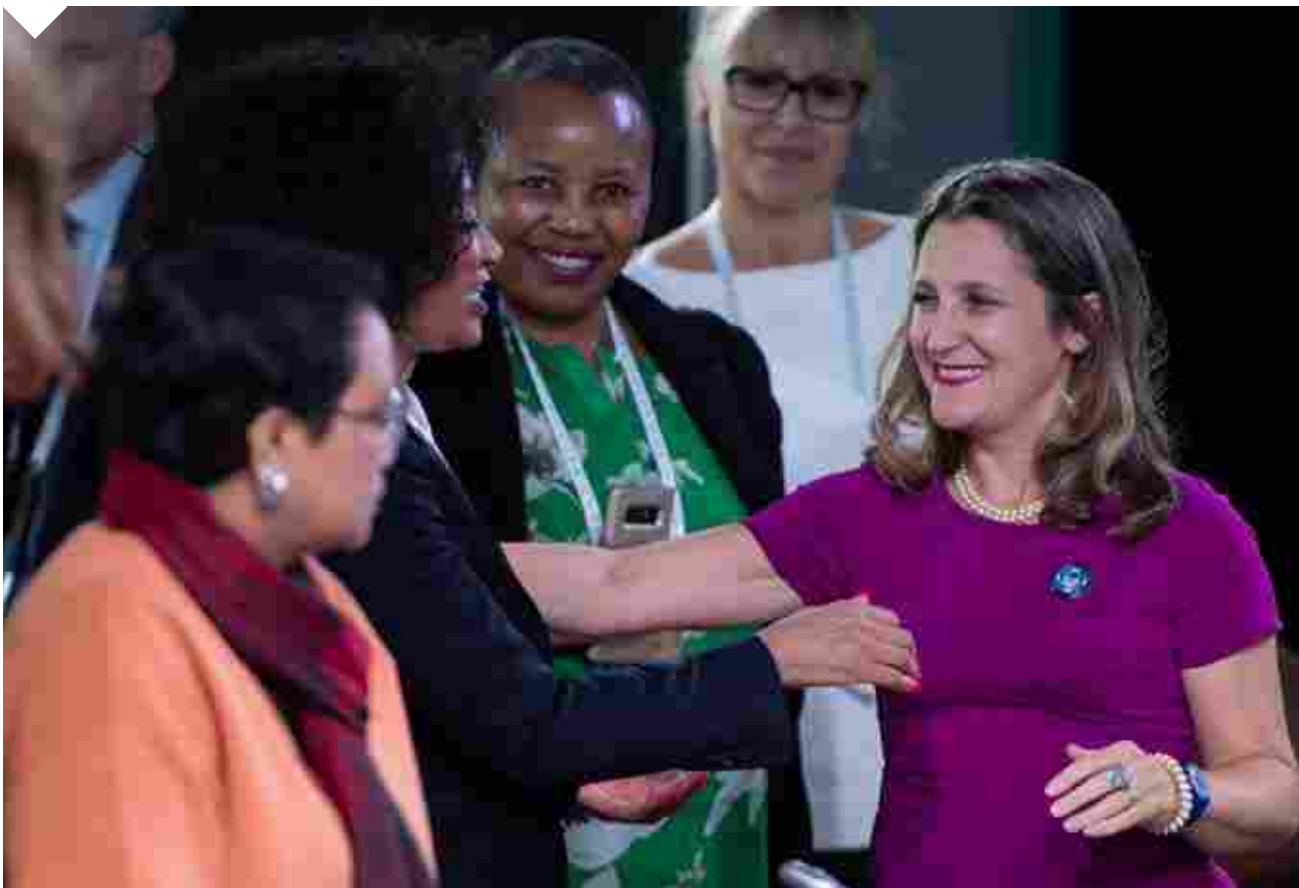
Canadian Foreign Minister Chrystia Freeland (right) greets counterparts (from left) Retno Lestari Priansari Marsudi (Indonesia) and Lindiwe Nonceba Sisulu (South Africa) at the Women Foreign Ministers meeting in Montreal.