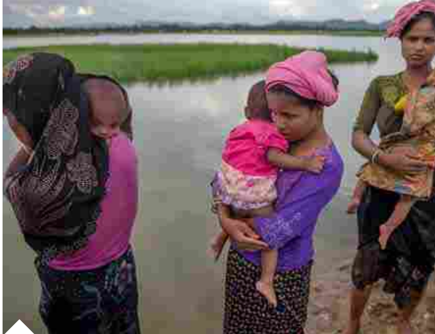
Rohingya Muslim women carry their sick children in Bangladesh. More than half of the world's refugees and IDPs are women or girls.

Fifth, there are real inequities in funding for refugees in different parts of the world — and probably even starker discrepancies for IDPs. In this regard, it is illustrative that several individual European countries spend more on processing and receiving thousands of asylum seekers than the UNHCR spends for all the rest