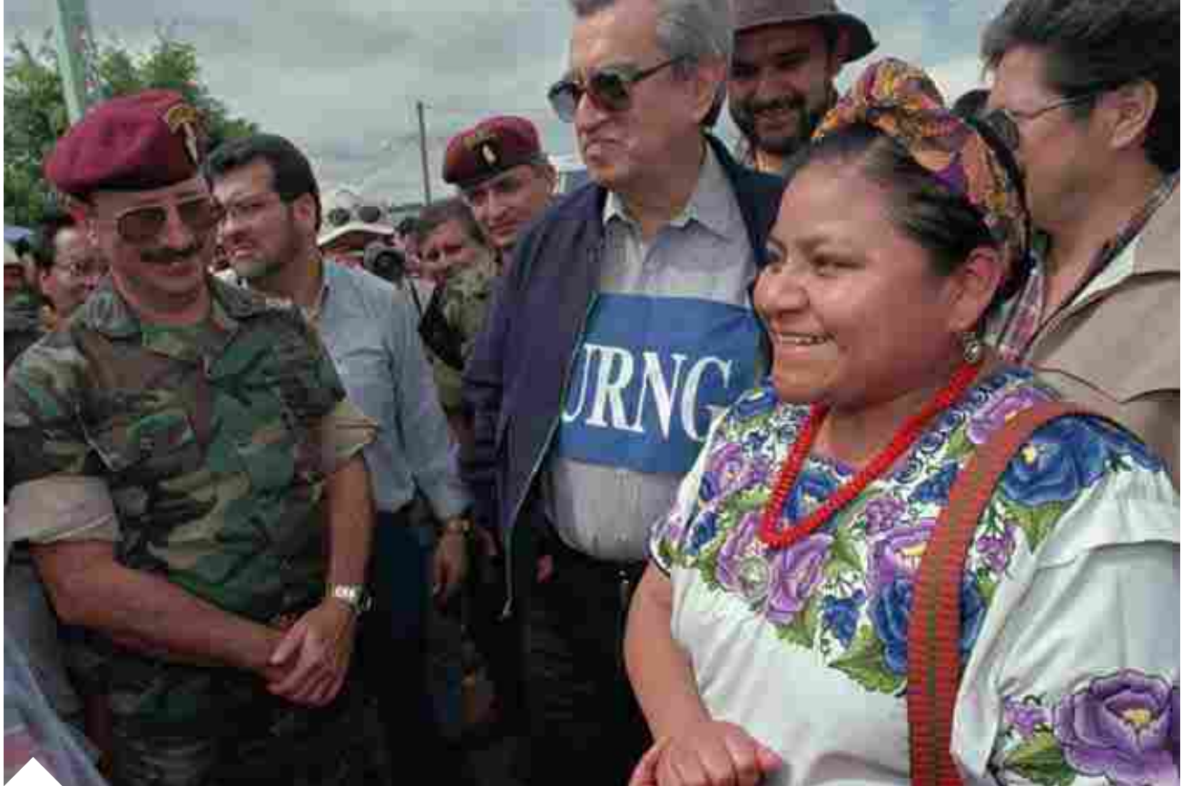
Nobel Peace Prize laureate Rigoberta Menchu played a key role in the Guatemalan peace process, a rare example of internally displaced people and refugees being involved in such negotiations.

While humanitarian agencies have generally done an excellent job in responding to the immediate needs of refugees and, in many cases, IDPs, their work is often carried out in isolation from others working on conflict prevention, conflict resolution and peace-building. Unlike the progress in closing the humanitarian-development gap, there has been little progress in overcoming the divide between humanitarian and political — or peace — actors. While humanitarian agencies need to be politically aware, they are constrained from overt political activity by the principles of neutrality and independence that provide them some protection and credibility in difficult operating environments.