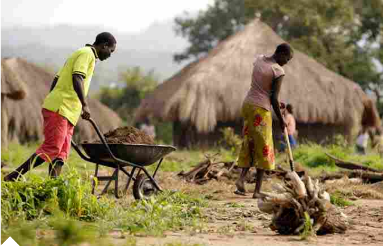
Two young people farm a field at the Rhino Refugee Camp Settlement in the north of Uganda, home to about 90,000 refugees from South Sudan.