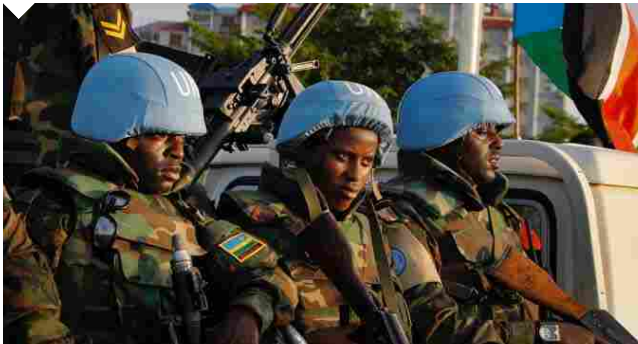
UN peacekeepers from Rwanda await members of the UN Security Council during a visit to South Sudan.

The WRC calls on the UN Security Council to include displacement as a standing item on its agenda and designate one of the elected members with the responsibility for carrying this forward.