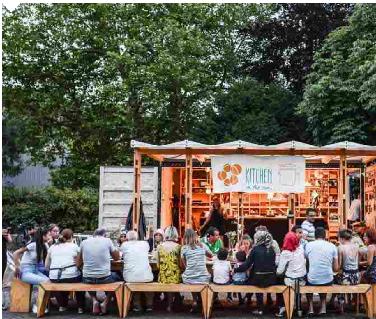
Kitchen on the Run, a mobile kitchen built in a shipping container, brings together refugees with local community members in Germany.

Sources: See https://ueberdentellerrand.org/en/ ; https://seebruecke.org/en/start/ .