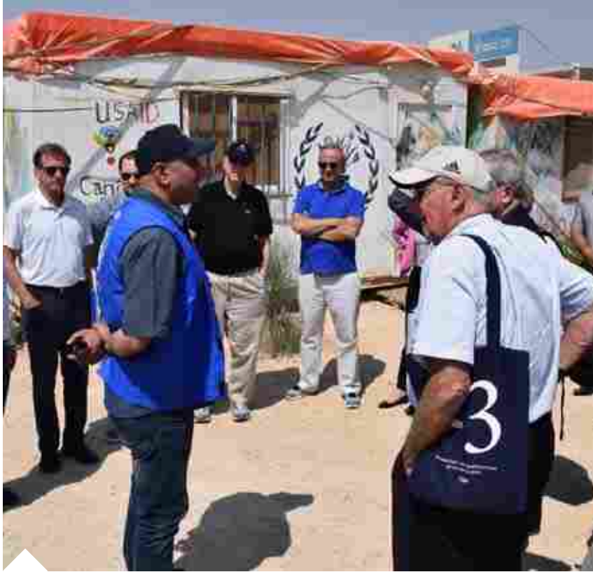
Zaatari refugee camp officials speak with WRC members.

international order is in jeopardy, as governments fail to protect their people and as the UN Security Council, largely paralyzed by the veto of its permanent members, is unable to prevent and resolve conflicts, and unable — or unwilling — to hold perpetrators of displacement accountable for their actions.