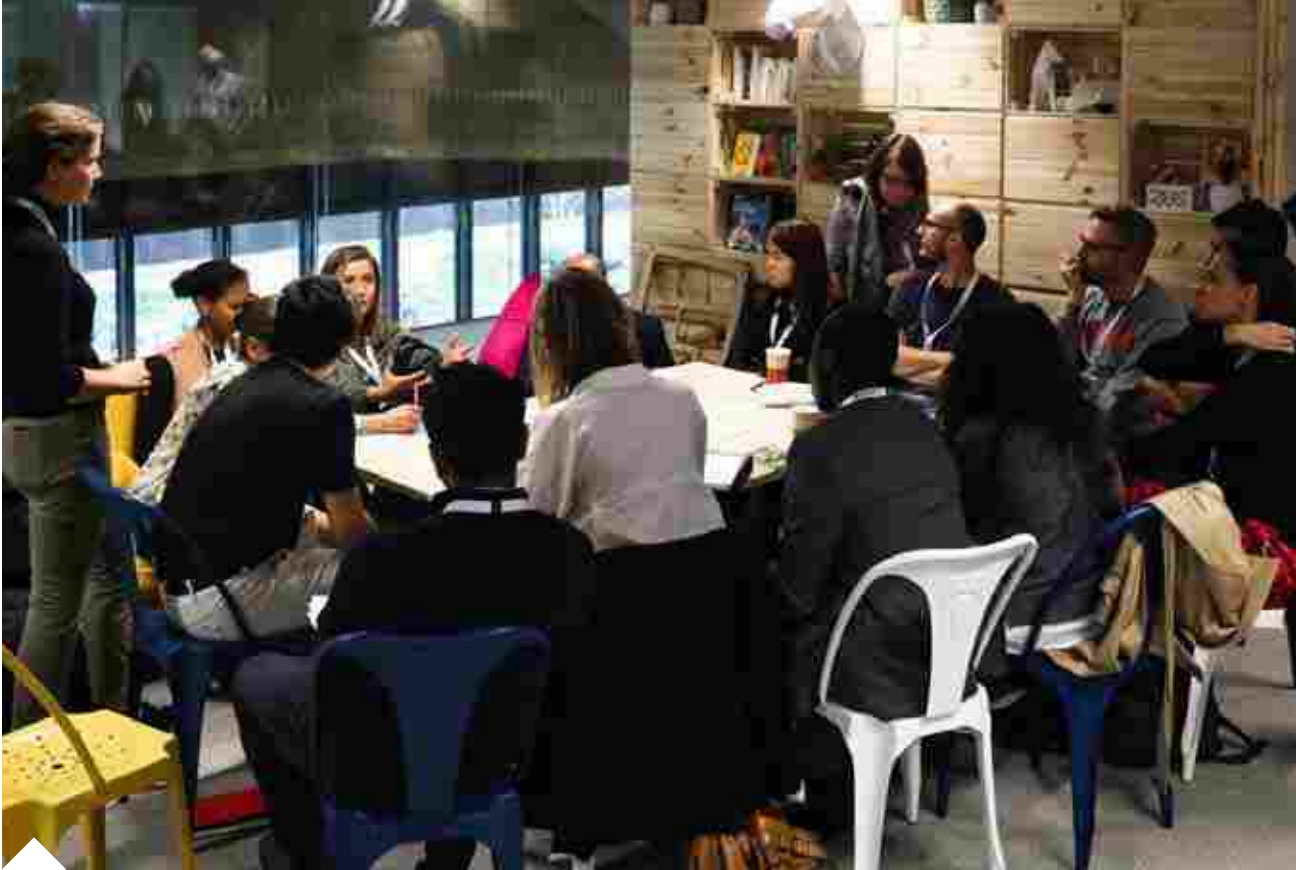
Social entrepreneurs, refugee engineers, policy makers and others gathered at the first Techfugees Global Summit in 2017, held in Paris, to talk about technology for and with refugees.

statement based on international human rights standards, may serve as a useful model for addressing some of these concerns (Amnesty International and Access Now 2018).