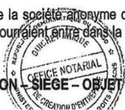
Figure 2. Excerpt from the Kwanza Capital statutes.

In 2015, Kwanza bought a 60% share in Sotexki, a textile company based in Kisangani that used to be one of the largest producers of textiles in the country. It provided a $2.4 million loan to help restart the company, which had at one point employed 2,500 people. From its inception, Kwanza Capital had also shown interest in becoming a majority shareholder of the Banque commerciale du Congo (BCDC), the second largest bank in the DRC in terms of its balance sheet and shareholder equity, notably by attempting in 2015 to buy the shares of the Forrest family, which owned 66% of BCDC. 17 According to a confidential report by the government of the United Kingdom on the financial sector in the DRC, the negotiations failed for two reasons. First, Kwanza Capital's offer of $43 million fell far short of the Forrest family's expectation of $75 million. Second, the family was unsure about the source of the funds. 18