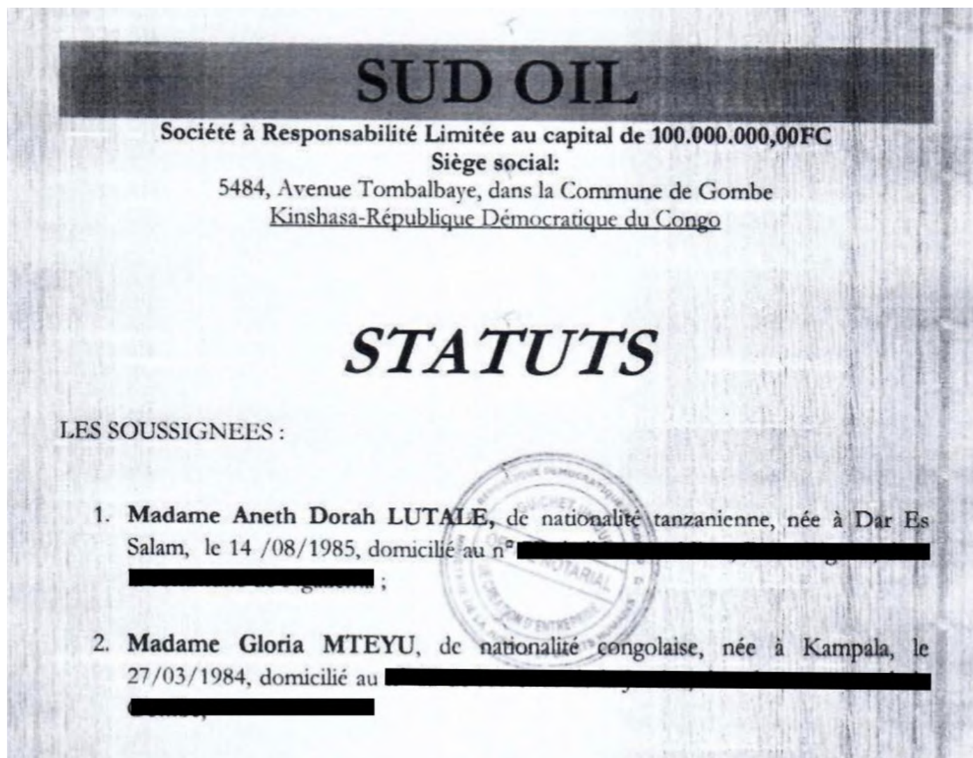
Figure 1. Excerpt of Sud Oil statutes after the transfer of ownership to members of the Kabila family.